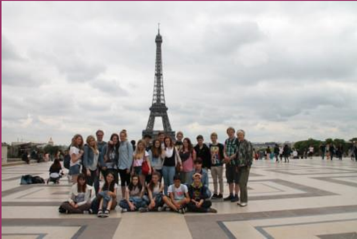
Klasse 8b in Paris